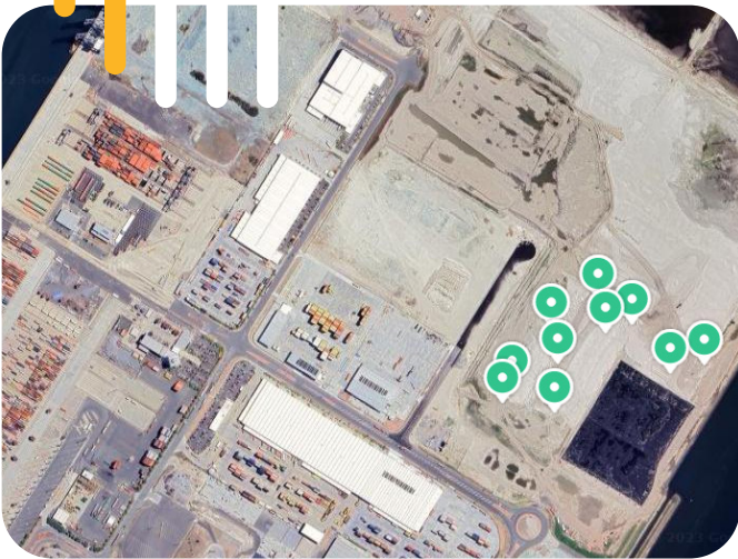
Overview of sensors in Kurloo Nest platform