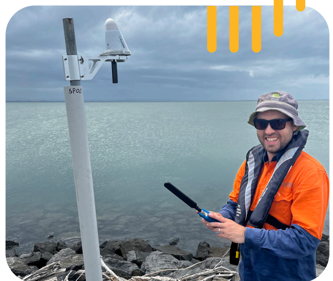
Kurloo x Port of Brisbane: Sea Wall Stability & Settlement Project